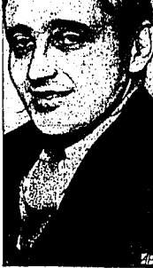
FORMER SEN. ERNEST W. GIBSON (above) of Brattleboro, Vt., has succeeded William Allen White as national chairman of the Committee to Defend America by Aiding the Allies. He is a captain in the 51st8 cavalry reserve.

program conducted last year on the Union Pacific train. The entire day will be devoted to educational phases involving potato propagation, utilization, and marketing. TEXAN SPEAKS AGAIN ON PROHIBITION AMENDMENT WASHINGTON, Jan. 17.—Senator Sheppard (D-Texas), "father of the Eighteenth amendment, told his colleagues yesterday that "an alcohol-drinking democracy cannot develop the maximum strength for national defense." The Texan spoke in observance of the 51st anniversary of the prohibition amendment, which he proposed be restored. It has been Sheppard's custom for years to observe the date with a speech in the senate.