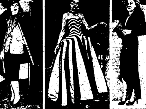
EXHIBITED at the Fashion Futures show in New York were these new creations. (left), a blue and white suit ensemble in tweed with matching cape with new gashed lines.