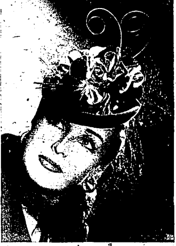
What a resemblance this hat bears to an insect, with those long "feelers." It is purely colorful, the bonnet's nautique being to decorate Rosemary Lane, film actress. Cockade of mastipure-hung flowers helps too.