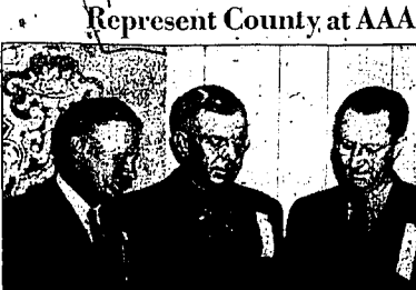
TWIN FALLS COUNTY is well represented this week at the meeting of Idaho AAA and farm committee members...