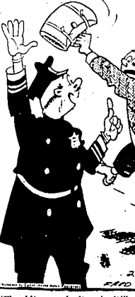
"Two-bits you don't make it"