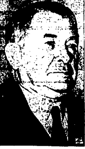
ALBEN W. BARKLEY... Senator leads drive...