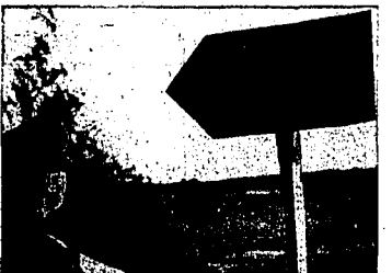
A GERMAN SOLDIER checks on his map as he studies a sign which shows the route of a bridge on the French coast.