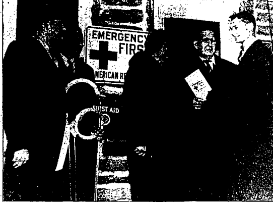
SECOND RED CROSS fire aid station to be established in Twin Falls county is now "ready for service" at Hollister, following a week of training and equipment.

San Francisco Blaze Claims Four Lives Disastrous Fire at Mission Community Center Traps Three Women and Boy