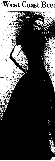
Hollywood naughtiness—pronounced smart at the Los Angeles Fashion Futura show. A real slim skirt is favored by a tulle, slitted at hips to show a slit in the skirt.