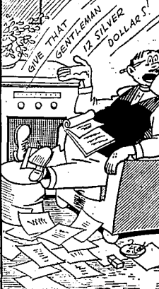
"Why should I work for money with all these radio programs giving it away?"