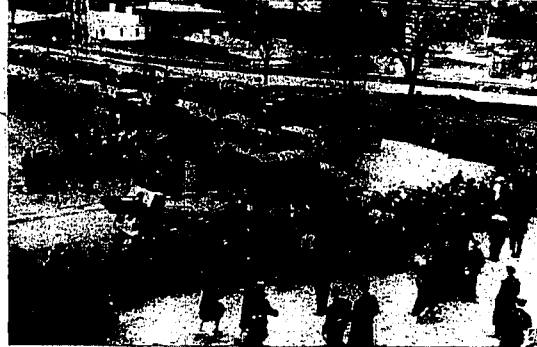
ONE OF THE LONGEST TREKS in the nation's military history went into motion as the 12th field artillery unit of Camp Humphreys, Tenn., moved northward on a 1,100-mile trek.