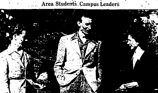
THREE Twin Falls area students have been elected to student offices at the University of Idaho at Moscow for the spring semester.