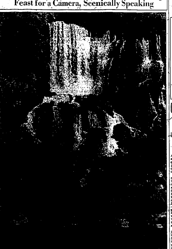
Feast for a Camera, Scenically Speaking

Slight Error PITTSBURGH—Curator J. Leroy Kay of Carnegie Museum says he found an "almost error" in Walt Disney's Panama. The picture has a scene of a ship being wrecked by Creteans period fighting a death battle with a sea monster of the Jurassic period.