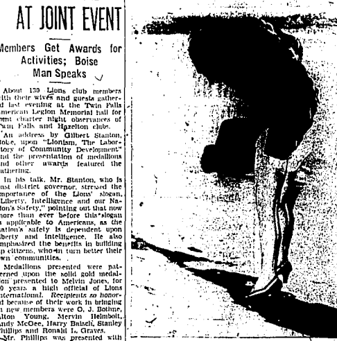
A SAMPLE of the pale-like winds that brought death to at least 13 persons in eastern North Dakota and western Minnesota, stilled Minneapolis with embarrassing results for one young lady who lost her hair in attempts to control her clothing.