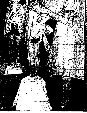
A scene common to many Twin Falls homes last night was that of little boys and girls receiving a helping hand in getting ready for today's celebration. Some of the boys are seen in the foreground, and a girl is seen in the background.

The Russian advance in the Ukraine is being reported as a military success.