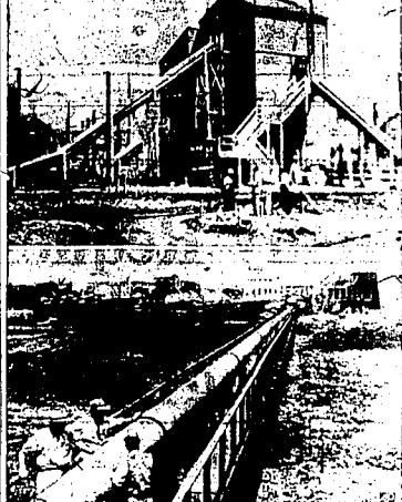
FROM THESE BUILDINGS on the Hillyard plain, south of Joliet, will come powder for a large part of the many TNT processing buildings at nearly-completed emergency plant. Note chute for quick exit of workers in emergency. Below, conveyor carrying building firm distance is to carry TNT to packing house to be boxed for shipment.