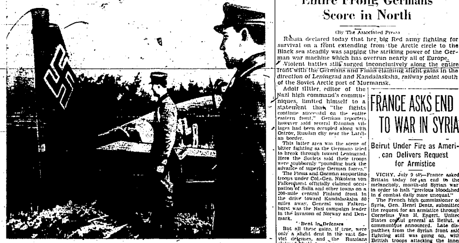
THIS PICTURE, first ever transmitted from Moscow, was received in New York via RCA as an experimental test transmission from Soviet government picture sending apparatus. The picture carried no caption material.