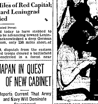
ASSEMBLY LINE METHODS were used at the Selective Service System headquarters in Washington, D. C. as the girls employ look over the task of putting numbers in capsules to be used in the second draft lottery...