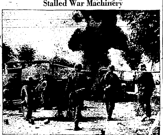
GERMAN ADVANCE THREATS, Berlin sources say, approach a group of crippled and stalled Soviet war machinery somewhere on the Russian front.

He appealed for "inspired leadership" to guide us through this hour of crisis and added that the United States must be made strong by we have never had so few of invasion or even a "halfhearted" power.