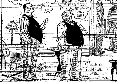
THE BIG CHIA-OIL MEN

INDEED! THAT'S REALLY, I AM CERTAIN YOU COULDN'T BRIBE OIL IN A CAN OF SARDINES, EGAD! I WOULD HATE TO YOU KNOW THAT I AM THE MAN WHO DISCOVERED THE GREAT PETROLEUM FIELDS OF CHIAIA! FAUGH - DON'T TRY TO TELL ME ABOUT OIL - SIR!