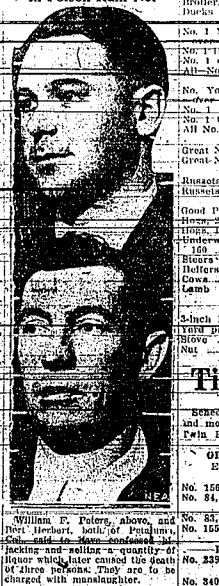
In Poison Rum Net

Potatoes IDAHO POTATOES IDAHO POTATOES IDAHO POTATOES