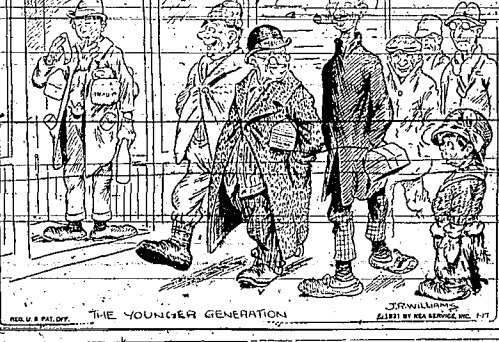
THE YOUNGER GENERATION