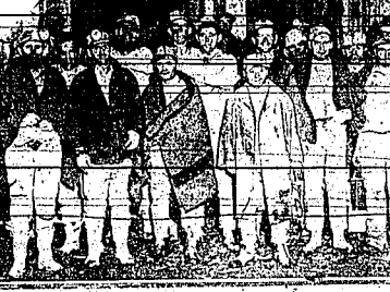
Here are the "Lucky Twenty" miners who escaped death after 20 hours entombment in the Mitchell shaft of their life...