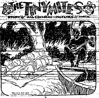
THE STORY BEHIND THE PICTURE

The little story had the happy ending. The mother and father, who had been separated for a long time, had found each other again. The mother had been in a sanatorium, and the father had been in a prison. They had both been through a great deal of suffering, but they had both survived. They were now together again, and they were happy. The mother had a beautiful baby, and the father had a job. They were all well and happy.