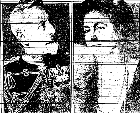
THE SPHERE-TURNER former Kaiser Wilhelm II. of Germany, in a portrait by the artist, is shown in the center of the photograph. He is surrounded by other members of the Kaiser's family, including his wife, Princess Hermine, shown at the right in a portrait by the artist. The Kaiser and other members of the Kaiser's family are shown in a photograph taken in 1918.