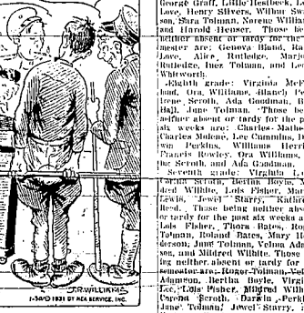
THE DEAD LETTER