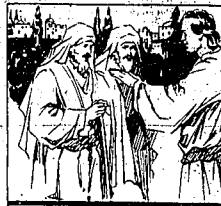
Christ needed additional missionaries. In this field he sent out seventy men in couples to visit the villages. He ordered them to preach and heal the sick, saying unto them the kingdom of God is come nigh unto you.