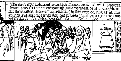
The seventy returned later their mission crowned with success. Jesus saw in their success an ultimate conquest of his kingdom. But he rebuked their self-satisfaction. In his rejoice, not that the spirits are subject unto you, but rejoice that your names are written in heaven.