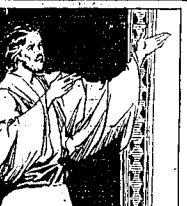
Christ needed and I thank thee, O Father, that thou didst hide these living from the wise and understanding and didst reveal them to babes. Ye Father for go! was well-pleasing in Thy sight.