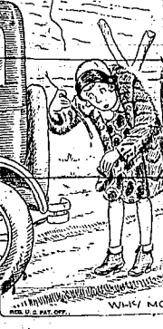
WHY MOTHERS GET GRAY.

YES, IT'S THE GAS— I'VE LOVED AGAIN TO BE SURE