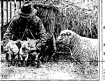
Hedden bulls and bears, J. P. Morgan, famous banker and financier, knows something about lamb-wool that the Wall Street variety. On his extensive estate at Briarcliff, N. Y., he raises Jacobin lambs and he is supposed to be the world's largest wool grower. Here you see a banker on his estate posing three little lambs for a photograph while the grand mother once looks on.