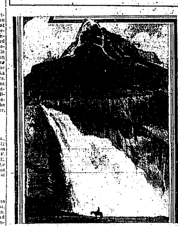
(Photograph, Coeur d'Alene Falls)

THAT river in the Canadian Rocky mountains are in flood when the weather is hottest and at low water when it rains? This is due to the fact that they find their source in the low fields which melt under the sun but change in rains which frequently turn to snow at high altitudes. The overflow of such a river, Emerson Falls at Mount Fabian British Columbia, is shown in the photograph.