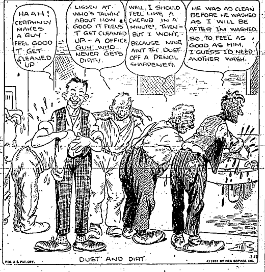
DUST AND DIRT