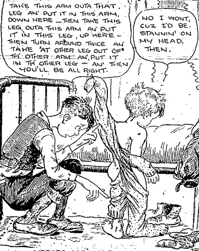
REG. U. S. PAT. OFF. HEROES ARE MADE - NOT BORN