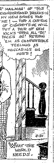
WHAT THE WORLD NEEDS