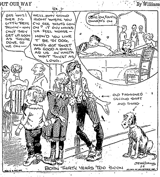
BORN THIRTY YEARS TOO SOON

Contard's party led by H. G. Wells and made more determined by repeated failures to locate the missing party.