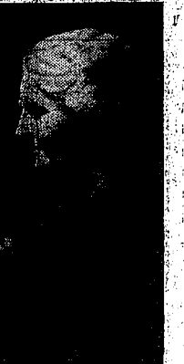
"Of course, it's Schilling's"