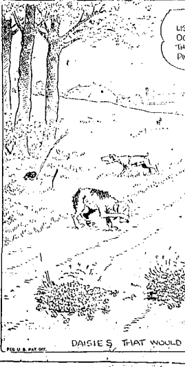
DAISIES THAT WOULD TELL