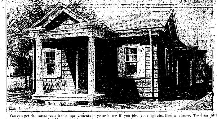
You can get the same remarkable improvements in your house if you give your imagination a chance. The trim little cottage above was once the old, worn-out home below.

HOOVER SPOKE PRESIDENT HOOVER did himself proud at Marion at the dedication of the Harding monument. A ticklish proposition it was for the President of the United States and one which had been postponed and put off from time to time.