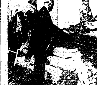
shows President Hoover laying wreath of flowers on the tomb of former President Warren G. Harding as part of the dedication ceremonies of the Harding memorial.