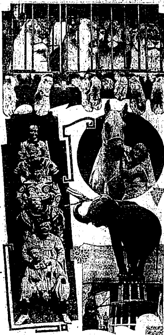
Lion, elephant, harem, circus and pretty girl riders will invade Twin Falls Monday when the G. B. Barnes Circus arrives for two performances opposite the Oregon Short Line depot.