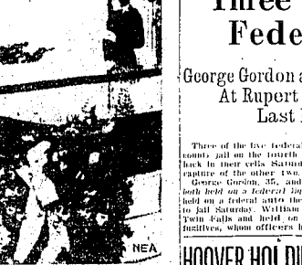
President Hoover laying wreath of flowers on the tomb of former President Warren G. Harding as part of the dedication ceremonies of the Harding memorial.