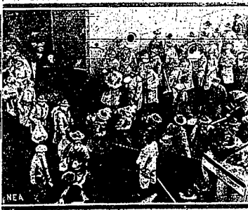
The Army transport docks at San Francisco assumed a warlike appearance when most of the 30th Infantry and a battery of the 7th Field Artillery embarked to participate in the army-maneuver maneuvers in Hawaii.