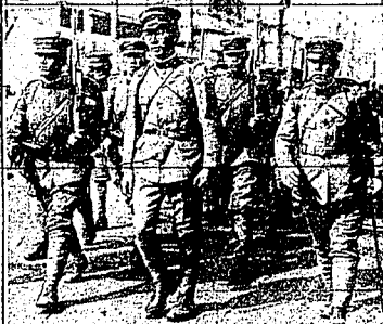
Japanese army troops have been ordered to Shanghai to reinforce marines and bluejackets in the war zone. Placed here on the march are typical Japanese infantrymen—members of the Imperial Guard regiment. At their head is bespectacled, 30-year-old Prince Chichibu, heir presumptive to the throne, who also may see action with his troops.