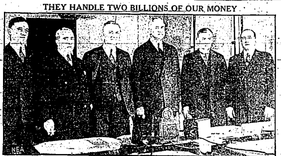
THEY HANDLE TWO BILLIONS OF OUR MONEY