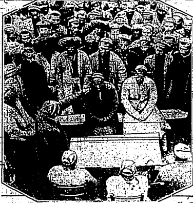
LAZY WORKERS IN RUSSIA PUNISHED

Here is probably the most novel type of court in the world, in session at the collective farm in Tashkent, Russia, and like many others in the hunt of the Soviet. Men who have maintained the full standard of production under the five-year plan, justice and deal but heavy penalties to their comrades who have been inefficient. The prosecutor is shown here pointing to two workers on trial.