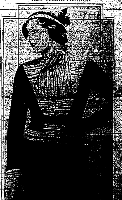
NEW SPRING FASHION

A brown and blue dress was created by a designer. It has a short-sleeved effect and the great pattern.