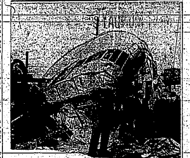
Victim of a sudden, fierce gale, the 100-year-old Columbia is shown above as it appeared a couple of weeks after crashing on Flamingo, Long Island. The ship's mechanic was killed when he jumped or fell from the gondola as destruction reared...