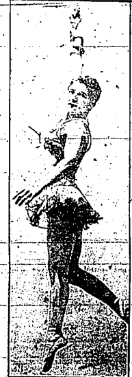
YOUNG SPORT STARS TO WED