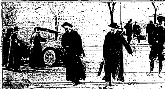
JESUIT PRIESTS ORDERED OUT OF SPAIN

Spain's new revolutionary government had spoken - the Jesuits must go! And pictured here is the scene, highly significant in the world's history, as black-robed members of the centuries-old Catholic order were expelled from their native land. Under the eyes of a Spanish officer, two of the priests are seen carrying their belongings in a clothes-bag across the frontier into France. The order had exerted powerful influence upon Spanish affairs since the sixteenth century.