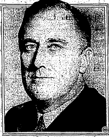
Gov. Franklin D. Roosevelt, of New York, who held an early advantage over Gov. William H. Murray, (Alaska) Murray, of Dakota, in the North Dakota primary election held Tuesday.