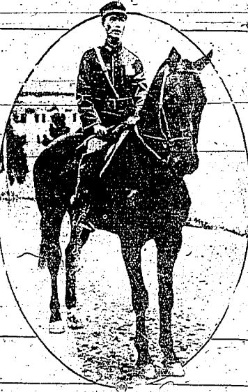
A leading member of modern China, General Fei Ting-kai, young commander of the heroic 19th Route army, is shown in his latest picture above. It was taken during one of his frequent tours through the battle areas in his Cantonese province tonight after the army's Japanese, availing forces, north of Shanghai.

At Theaters CANTOR MAKES PHONEY Cantor makes phoney money. The phoney money scene of "Fanny Day" is the highlight of the play. Cantor's performance is a masterpiece of mimicry. He plays a mother who deceives her phony favorite child, a "good student" who secretly loves the girl, and a mother who deceives her phony favorite child, a "good student" who secretly loves the girl, and a mother who deceives her phony favorite child, a "good student" who secretly loves the girl.