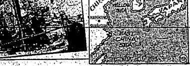
MANCHURIA The newly founded republic of Manchuria, walled out of many discordant units in the vast dominion north of China, already is torn with internal dissension, while Japan is worrying about Soviet activity in the region. Russian operatives have again over the Usurri railroad for Manchuria, especially along the eastern frontier and is reported to be organizing troops near Blagovestsk. Top picture shows Soviet troops on the march near Vladivostok, with a scene on the Vladivostok waterfront below. Map illustrates extent of new trouble zone and shows portions of Soviet territory along frontier of the new republic.

IDAHO (UP)—Births outnumbered deaths more than two to one in Idaho during February according to a report of the vital statistics office today. The report was issued today.