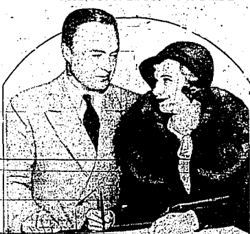
PRINCESS JOAN BECOMES A BRIDE

Joan Bennett, youngest daughter of the noted actor, Richard Bennett, became the bride of Gene Markey, well known scenario writer, in a Los Angeles wedding. Here's Joan, above, making soulfully into the eyes of her intended when they apollo for their license in the Los Angeles bureau. At left, Joan's beguiling everyday expression when not looking at her new hubby.