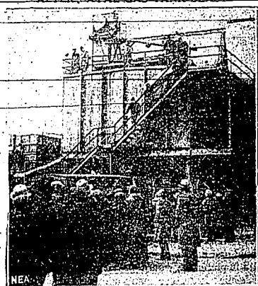
AFTER FATAL GAS-TANK BLAST

A terrific explosion which shattered a gas tank at the Public Service Corporation plant in Camden, N. J., had taken a toll of at least eight lives when the picture was taken, showing a crowd about the plant as rescuers brought out the bodies of one victim. Four persons were known to have been injured and twelve to fifteen others were missing.