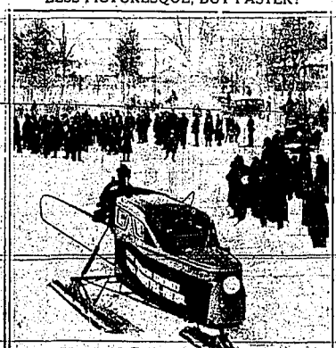
LESS PICTURESQUE, BUT FASTER!

Unlike the old-fashioned horse-drawn sleighs that once were synonymous with the Russian scene, this "arsenoid" whirled into view on Moscow's snow-covered streets the other day in show proud citizens the Soviet government's newest mechanical product. The sled-like vehicle, capable of considerable speed, is driven by propellers.