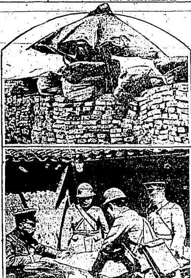
CHINESE CLING TO WAR UMBRELLAS

War umbrellas, for centuries an important bit of equipment of Chinese soldiers, are still used by the invading army in the present conflict near Shanghai. Study Japanese used shell-proof "ironies," Chinese private of the 12th route army is shown in top picture leaning out from beneath his umbrella at one of the outposts. The umbrella, not only keeps off rain, but hides the soldier from enemy lookouts. Below, Lieutenant General Kenkichi Iyoda, commanding Japanese army detachment, in conference with aides, mapping action in temporary headquarters at Kiangsu.