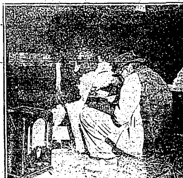
WHILE KIDNAPING NEWS WAS BROADCAST