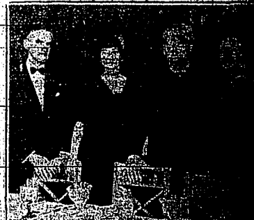
A MEETING OF LITERARY LIONS

It was a meeting of the literary lions of the Midwest. American, above, is the author of "The American Dream" and "The American Way." To the right are O'Neill, Strindberg, and Shaw.