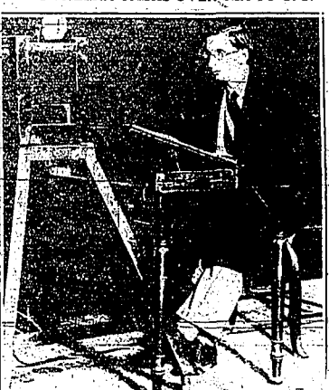
DE-VALERA TALKS OVER SEA TO U. S.

The voice of Gen. Francisco Franco, new President, was heard on radio sets throughout the United States when this picture was taken showing Francisco de Valera before the microphone in a Dublin broadcast studio. This is the most recent photo of the fiery Irish leader.