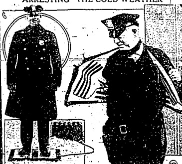
"ARRESTING" THE COLD WEATHER

They would never hold no terror for street-corner policemen now. This Schenectady, N. Y., officer—feeling a bit shivery after unfastening a traffic snarl—has stopped the man (at left) onto a metal plate connected with a battery. Almost instantly heat begins to rise through this strip of rubber, with electric heating elements vulcanized inside. But eye rested in the lining of his uniform (as shown at right) and the smiles of his ribs. Pretty hot idea, eh?