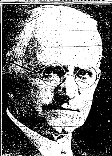
GEORGE EASTMAN COMMITS SUICIDE

"To my friends: My work is done. Why wait? . . . That was the brief note which George Eastman, 77-year-old multi-millionaire manufacturer and philanthropist, wrote before he shot himself to death in his Rochester, N. Y., home. World famous as a genius of the photographic industry, art collector and big game hunter, Eastman is shown here in a recent portrait.