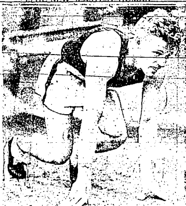
IS HE NEW "FASTEST HUMAN"?