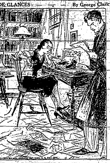
At The Theaters