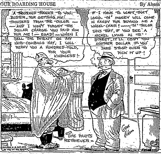
THE PAINTS RETRIEVER