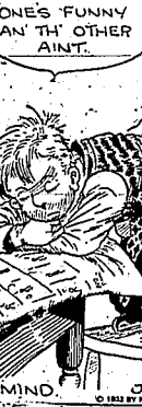
THE ONE TRACK MIND. BY WILLIAMS. © 1933 BY NEA SERVICE, INC. REG. U. S. PAT. OFF.