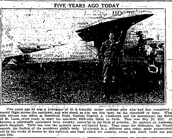
Five years ago today was a youngster of 25, a friendly, rather reckless pilot who had just completed a record flight across the continent, and who stood as you see him here, on the threshold of fame. When this picture was taken at Roosevelt Field, Captain Charles A. Lindbergh and his monoplane, the Spirit of St. Louis, were ready to start the non-stop flight to Paris. That was May 20, 1927. He became a universally acclaimed hero, wealthy, powerful in the field of aviation. He married an Ambassador's daughter. Their son was the nation's most celebrated baby. They came the kidnaping, the frantic search, the finding of the murdered child's body. Lindbergh is a different man today, made prematurely old by the weeks of horror he has suffered, and from which his country, owing him much, could not protect him.

to the following address: Fashion Magazine, 10c a copy when ordered with a pattern and sent