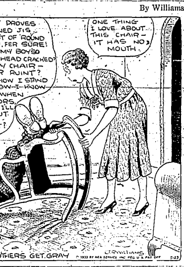
WHY MOTHERS GET GRAY

NOW I KNOW JIST HOW I STAND AROUND HERE—NOW I KNOW THE WHAT TO SAY WHEN I GET ASTER FER FAVOR BY CERTAIN PEOPLE—I'LL SAY, HOW 'BOUT YOUR LOVELY CHAIR DOIN IT?