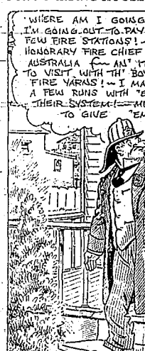
ONE OF THE VISITING FIREFMEN