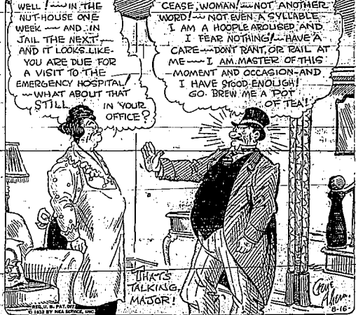
WELL IN THE NUT-HOUSE ONE WEEK AND IN JAIL THE NEXT AND IT LOOKS LIKE YOU ARE DUE FOR A VISIT TO THE EMERGENCY HOSPITAL... CEASE, WOMAN! NOT ANOTHER WORD! NOT EVEN A SYLLABLE! I AM A HOOPLE AND I FEAR NOTHING! I CARE—DON'T RANT, OR TALK AT ME—I AM MASTER OF THIS MOMENT AND OCCASION—AND I HAVE SPED ENOUGH! GO, BREW ME A TUB OF TEA!