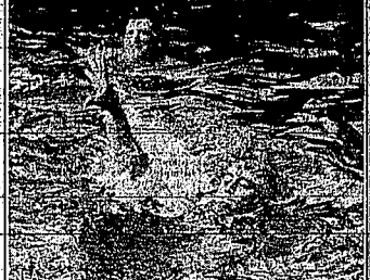
When this picture was snapped, Governor Franklin D. Roosevelt Democratic nominee for president, was frolicking like a youngster in the pool on his estate at Hyde Park, N. Y. That picture was taken at the same time as a photograph of Roosevelt in a fielded swimmer, and anyway, he had just finished a bath while playing water polo with members of his family.