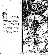
THE LITTLE PIG IS COMING DOWN THE TOWN