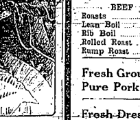
HERE IS A SPOTTED YELLOW GRAM AS GREATLY SUDDENLY LEAPS FROM HIS PERCH IN THE TREE OVERHEAD