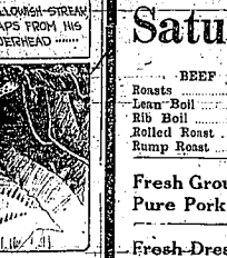
SEE OL' FELLA—I'D RATHER WANT TO GO WITHOUT NOA—YOU'RE MY GUIDE, BODY GUARD AN' MEAL TICKET DE LUKE