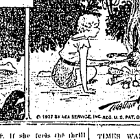
THEY WANT ADS OBTAINED