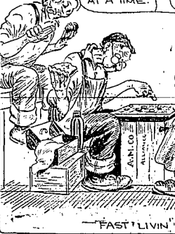
FAST LIVIN' BY WILLIAMS