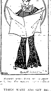
Flapper Fanny says she is not a flapper...