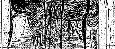
BY SCULPING ALL HIS NEEDS, HE ASSURED THEY WOULD BE CARLY CHANGES WAS MADE IN THE LACES ON