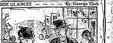
The Hudson Valley IS BEFORE THE GRAND CANYON THE HUDSON VALLEY IS BEFORE THE GRAND CANYON