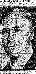
GOV. BEN ROSS