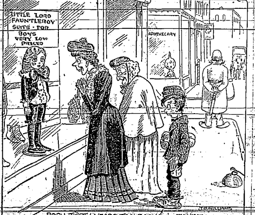
BORN THIRTY YEARS TOO SOON