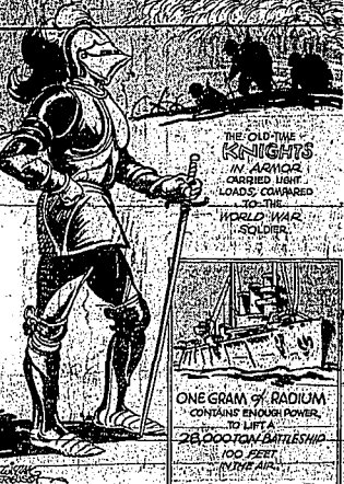
ONE GRAM OF RADIUM CONTAINS ENOUGH POWER TO LIFT 26 COOTON BATTERED 100 FEET THROUGH AIR