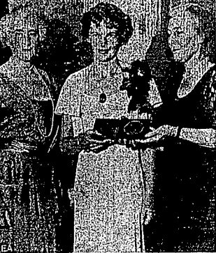
Amelia Earhart, first woman to fly solo across the Atlantic Ocean, is honored anew by the House of Representatives today.