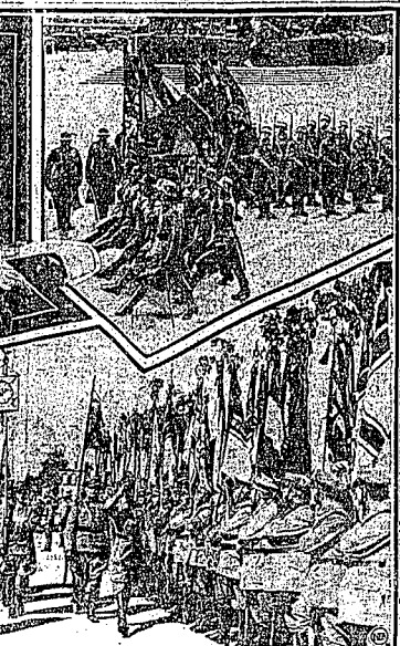
GERMANY'S NEW MILITARISM AND THE MAN BEHIND IT—Above, in the left, is General Kurt von Schleicher, the power behind the present German government and leader in the nation's demands to rearm. In the right, corner, is a member of the Wehrmacht, the German military organization of World War veterans, being inspired by the former general's picture, shown in silhouette in salute.