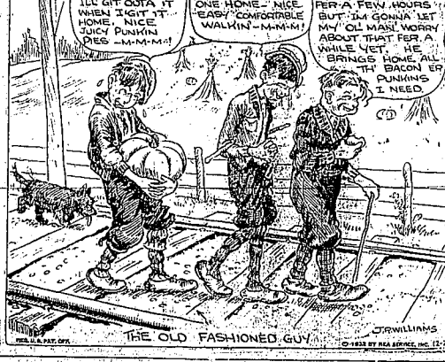
THE OLD FASHIONED GUY