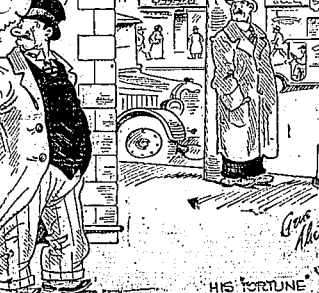
NEALS BY BARTO, CO.