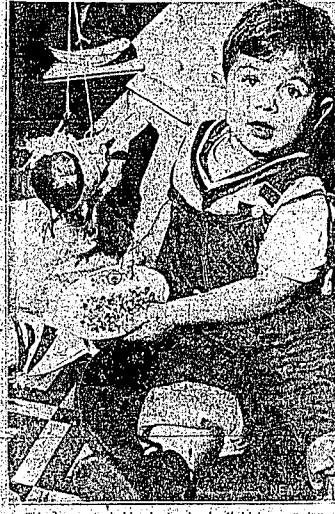
This pigeon got a bad break when it straited into a man's trap at San Francisco...