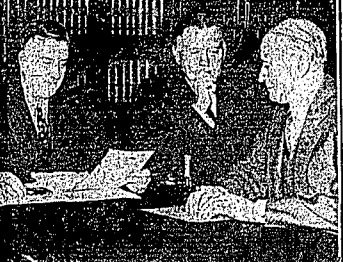
The text terms of a repeal resolution to be presented to the Senate is worrying members of the subcommittee.